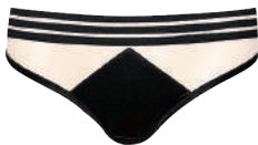
8076 LONG SOCKS S/M, L/XL, 2XL