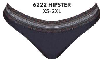
6222 HIPSTER XS-2XL