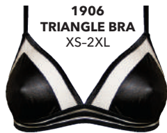
1906 TRIANGLE BRA XS-2XL