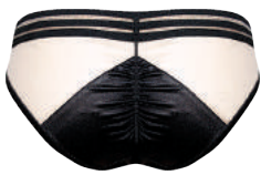
20012 HIPSTER XS-2XL