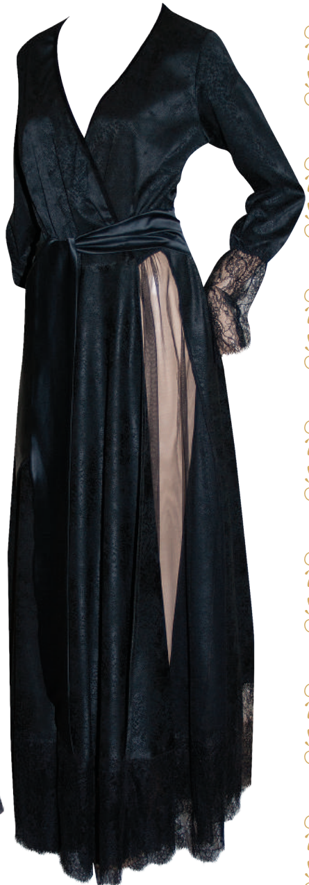
11075 KIMONO DRESS XS-2XL