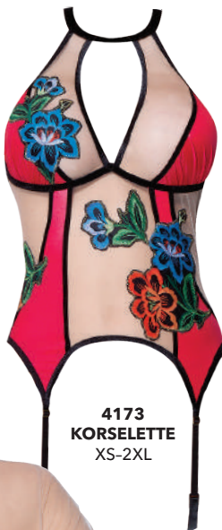
4173 KORSELETTE XS-2XL