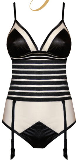
14056 BODY XS-2XL