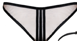
20015 STRING S/M, L/XL