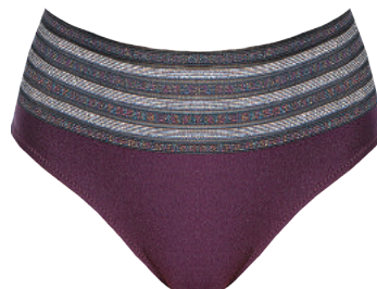
6223 PANTY XS-2XL