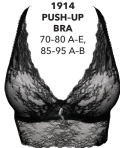
1914 PUSH-UP BRA 70-80 A-E, 85-95 A-B