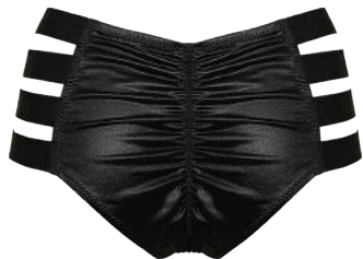
6227 HIGH-WAIST PANTY XS, S/M, L/XL