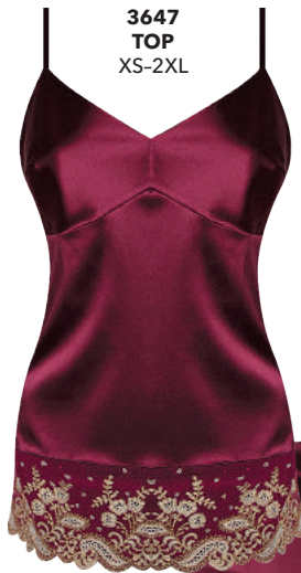
3647 TOP XS-2XL