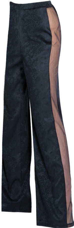
12035 PANTS XS-XL