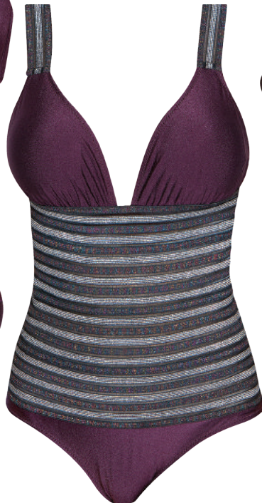
6219 ONE PIECE XS-2XL