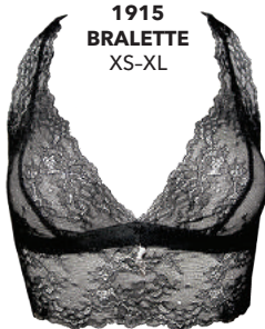
1915 BRALETTE XS-XL