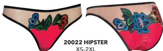
20022 HIPSTER XS-2XL