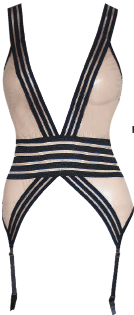
4172 KOSELETTE XS-2XL