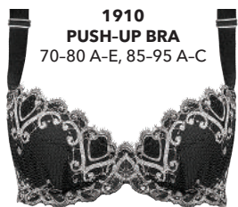
1910 PUSH-UP BRA 70-80 A-E, 85-95 A-C