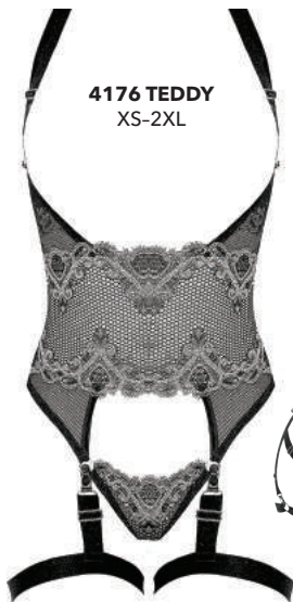
4176 TEDDY XS-2XL