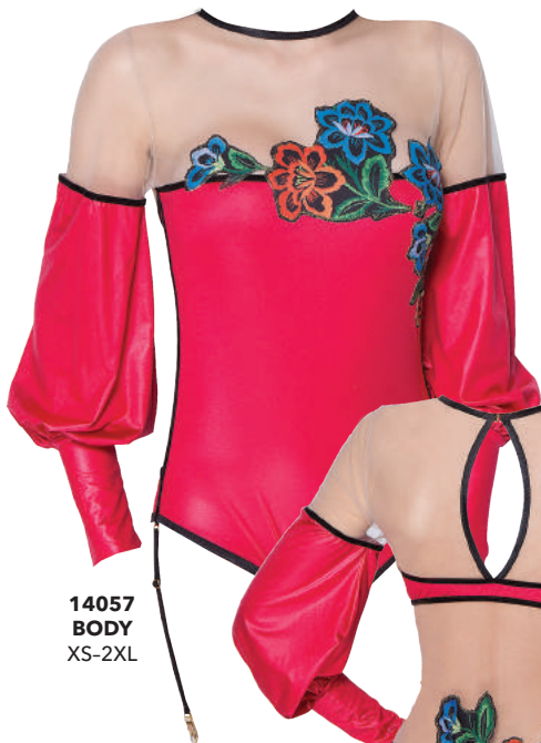
14057 BODY XS-2XL