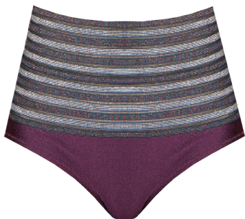
6221 HIGH-WAIST PANTY XS-2XL