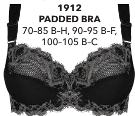
1912 PADDED BRA 70-85 B-H, 90-95 B-F, 100-105 B-C