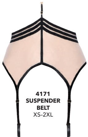
4171 SUSPENDER BELT XS-2XL