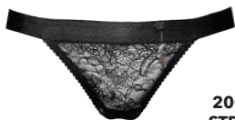
20007 STRING XS-2XL