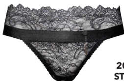
20009 STRING XS-2XL