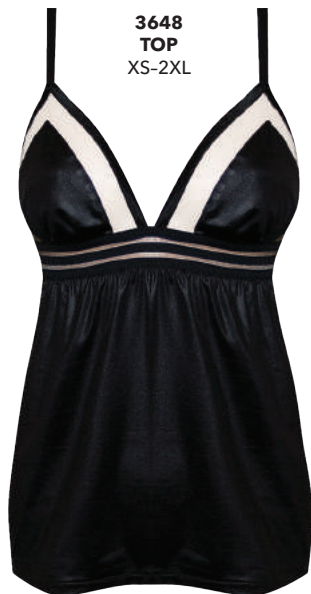
3648 TOP XS-2XL