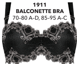
1911 BALCONETTE BRA 70-80 A-D, 85-95 A-C