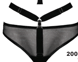
20017 STRING XS-2XL