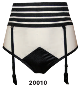
20010 HIGH-WAIST PANTY XS-2XL