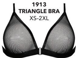
1913 TRIANGLE BRA XS-2XL