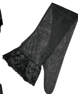
8077 STOCKINGS XS, S/M, L/XL