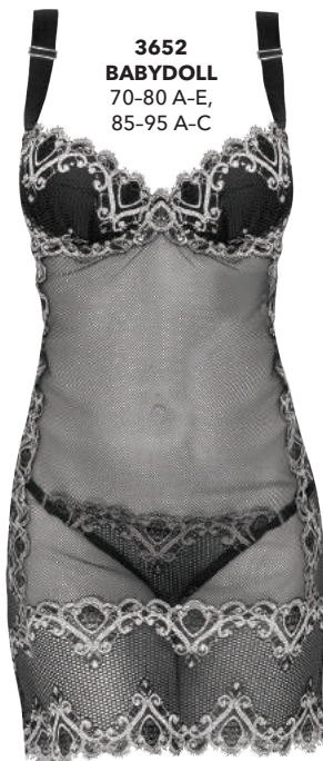
3652 BABYDOLL 70-80 A-E, 85-95 A-C