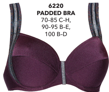
6220 PADDED BRA 70-85 C-H, 90-95 B-E, 100 B-D