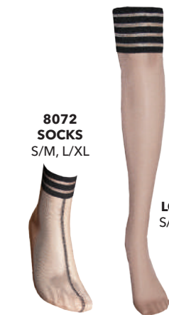
8072 SOCKS S/M, L/XL