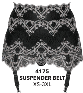
4175 SUSPENDER BELT XS-3XL