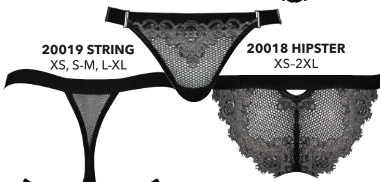
20018 HIPSTER XS-2XL