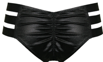
6226 PANTY S-M, L-XL