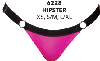
6228 HIPSTER XS, S/M, L/XL