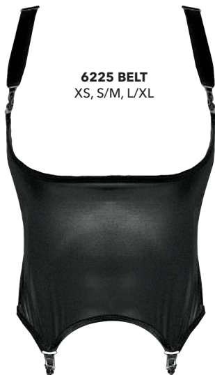
6225 BELT XS, S/M, L/XL