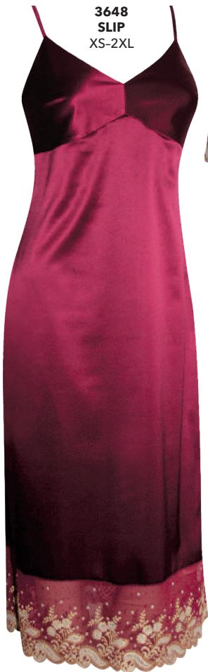
3648 SLIP XS-2XL