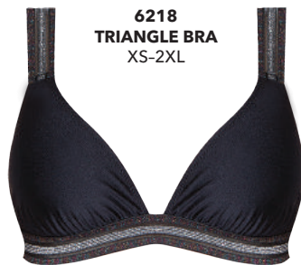
6218 TRIANGLE BRA XS-2XL