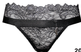
20008 HIPSTER XS-2XL