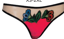
20021 STRING XS-2XL