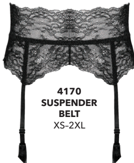
4170 SUSPENDER BELT XS-2XL