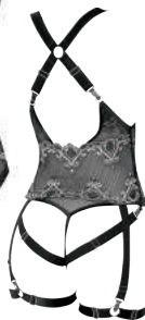
20020 STRING ONE SIZE