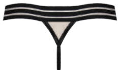
20011 STRING XS-2XL