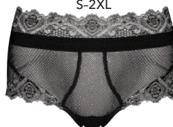
20016 PANTY S-2XL