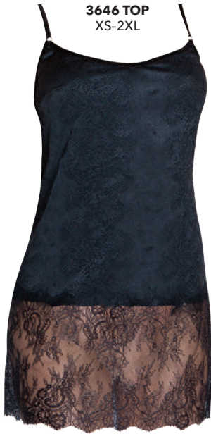
3646 TOP XS-2XL