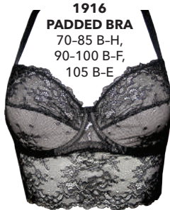
1916 PADDED BRA 70-85 B-H, 90-100 B-F, 105 B-E