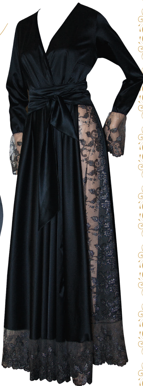
11076 KIMONO DRESS XS-3XL