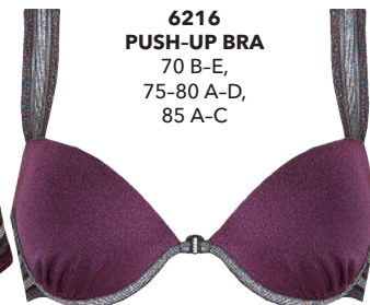
6216 PUSH-UP BRA 70 B-E, 75-80 A-D, 85 A-C