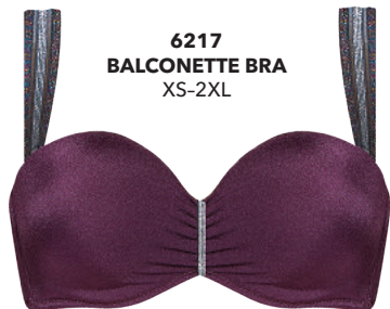
6217 BALCONETTE BRA XS-2XL