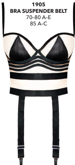
1905 BRA SUSPENDER BELT 70-80 A-E 85 A-C