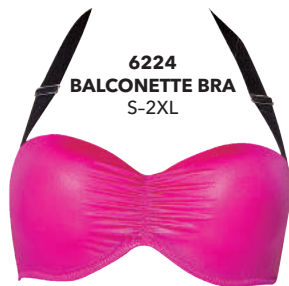
6224 BALCONETTE BRA S-2XL