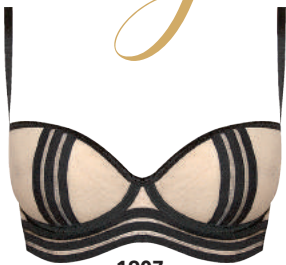
1907 PUSH-UP BRA 70-80 A-E, 85-90 A-C