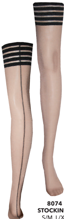
8074 STOCKINGS S/M, L/XL