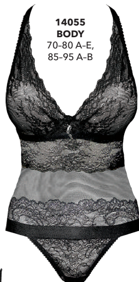
14055 BODY 70-80 A-E, 85-95 A-B