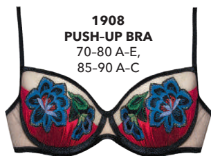
1908 PUSH-UP BRA 70-80 A-E, 85-90 A-C