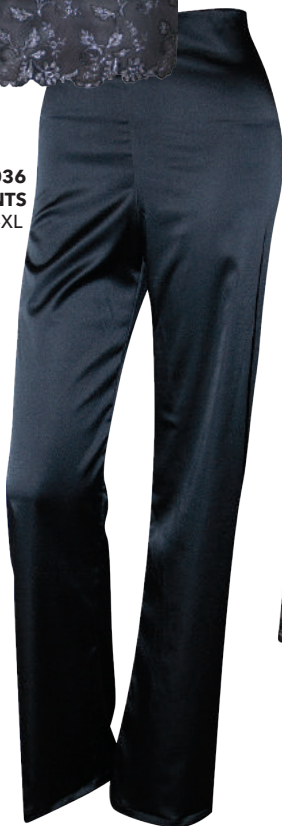
12036 PANTS XS-XL