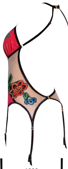
1909 TRIANGLE BRA XS-XL